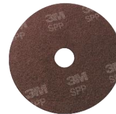
SPP Plus cleaning pad