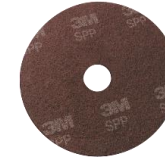
SPP Plus clean pad