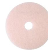
3600 professional scratches removal