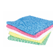
Efficient cleaning cloth