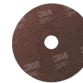
SPP Plus clean pad