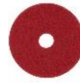
5100 Red clean pad