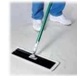
Microfiber flat drag