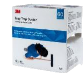
easy sticky dust cloth