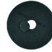
5300 Blue clean pad