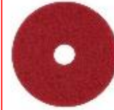
Red clean pad