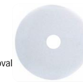
4100 white polishing pad